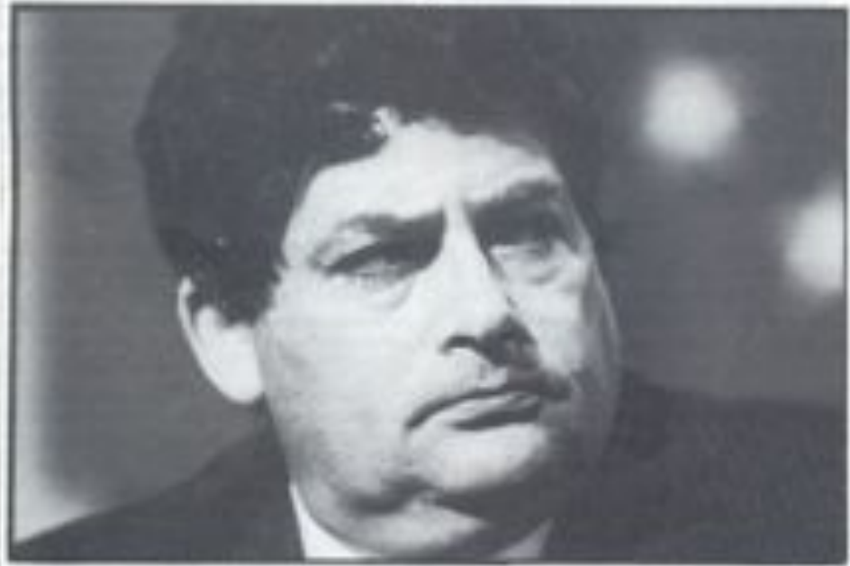
NIGEL LAWSON, Charrcellor of the Exchequer, advocate of more asset sales and scheme to shares to -oke-

Yes, as part of the new Tory crusade for an equity and property owning democracy they are trying to woo the 'small investor', ie anyone with up to £5,000 at their disposal. With the recent £524m BP share sale the government tried to make it easier to apply for shares and allocated a certain percentage of shares to 'small investors'. But it's still a lottery