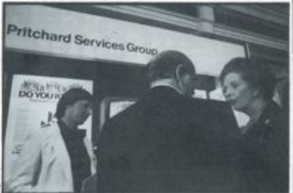
Thatcher inquiring about the grass cutting costs and quality of work of a well known firm of gardeners at the recent Tory Party conference in Blackpool.

This pamphlet is an update of an earlier GMBATU publication on resisting private contractors, containing details of the latest Regulations under the Land Act as well as a clear explanation of the Act itself. It gives a brief description of how a number of DLOs have been effectively resisting privatisation and goes on to offer a detailed strategy for the defence of DLOs.